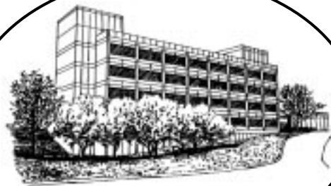
UMTRI 2901 Baxter Road